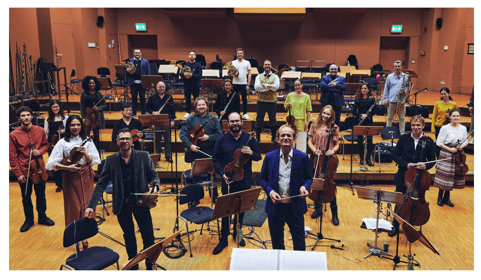
The classical players after a recording session in Baden-Baden / Germany

His idea now was to bring both together. The first musicians for this came together in a wide variety of